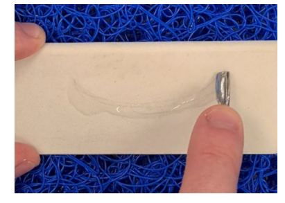
Draw the instrument from right to left in the shape of the "U" back and forth, pressing hard enough to see metal filings on the stone.