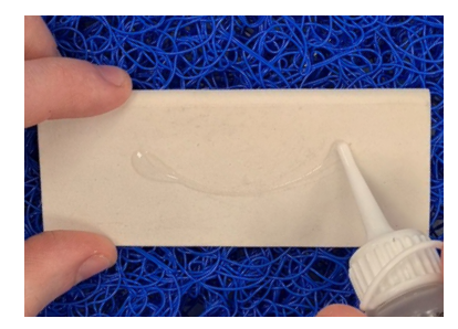
Drip a small amount of oil ( MD30 ) onto the flat surface of your stone in the shape of a smile or a shallow "U" shape.